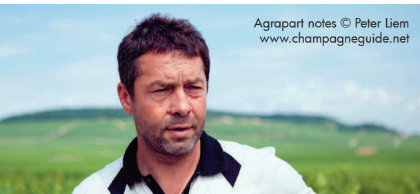
Agrapart notes © Peter Liem www.champagneguide.net

"With its broad aromas and nearly exotic fruit character, the nose immediately gives away this wine's origins in clay soils. It's large in body without showing any excess fat, its ripe flavors tightly wound into a vivid, sleekly-shaped fuselage that takes forever to end. Despite its youth it's already complex and expressive, anchored by a saline, oyster-shell minerality, and its finish feels harmonious, complete and impeccably refined. This seems destined to be one of the great champagnes of the vintage, and it will be thrilling to watch it develop."