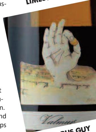
NEW CHABLIS GUY